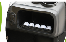
Storage compartment with golf ball & tee holder