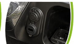
USB charging port