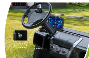
Adjustable steering column