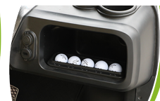
Storage compartment with golf ball & tee holder