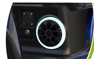
Stereo system with lights