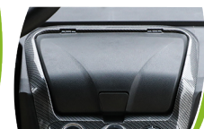
Built-in refrigerator (option)