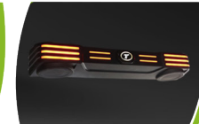
Cuboid sound bar