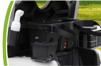
Golf bag holder and storage basket