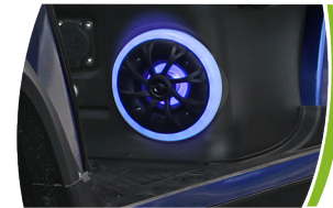
Stereo system with lights