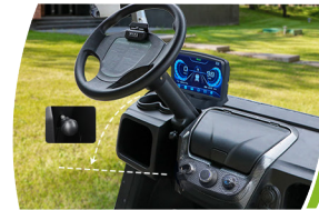
Adjustable steering column