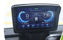
9" Bluetooth touchscreen