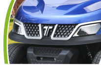
LED headlights /Taillights