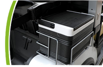
Caddy master cooler