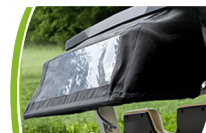
Golf bag cover with retractable mechanism