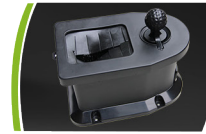
Golf ball washer