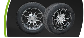
12" Aluminum wheel 205/50R12