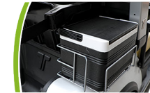
Caddy master cooler