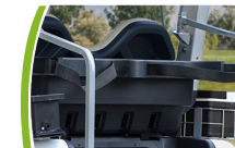
Golf bag holder & Storage compartment