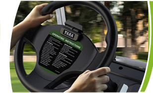
Comfort grip steering wheel with scorecard holder