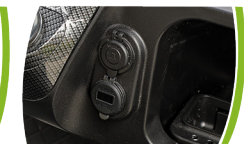
USB charging port