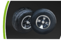
8" iron wheel 18/8.5-8 tire