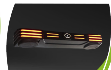
Cuboid sound bar