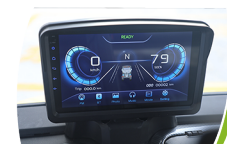
9" Bluetooth Touchscreen