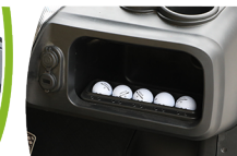
Storage compartment with golf ball & tee holder