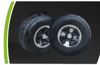
8" iron wheel 18/8.5-8 tire