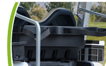
Golf bag holder & Storage compartment