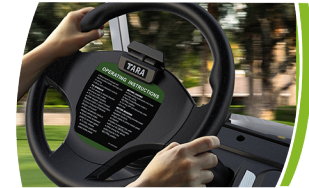
Comfort grip steering wheel with scorecard holder