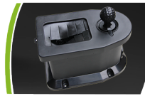
Golf ball washer