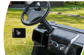
Adjustable steering column