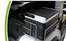
Caddy master cooler