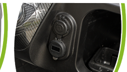
USB charging port