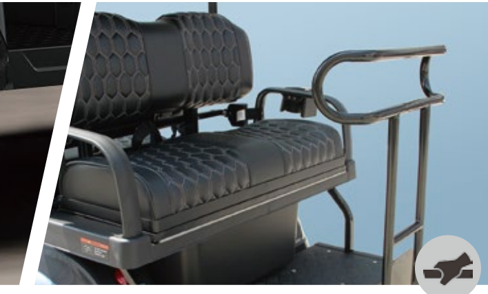
REAR HANDRAIL FOR 2+2 MODEL

14x7"aluminum wheel/ 22x10-14 silent tire with off-road thread