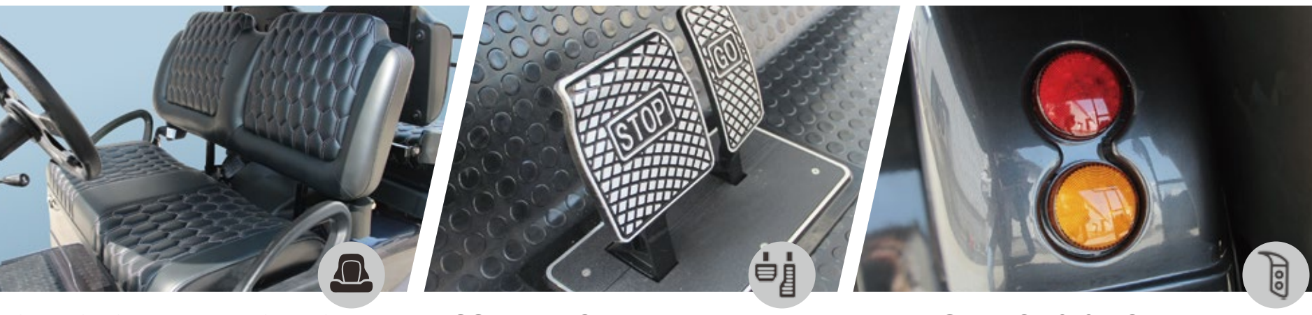
TOP-NOTCH LUXURY SEATS

Manufactured from solid colored plastic, these tops are fitted with Track enclosure rail that is built right into the top framing