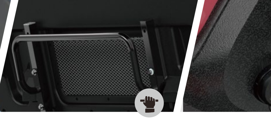
SEAT BACK COVER ASSEMBLY

Adjustable steering wheel is specifically designed to make the driving easier .lt works by tilting up and down, depending on what makes it easier for the driver to drive.