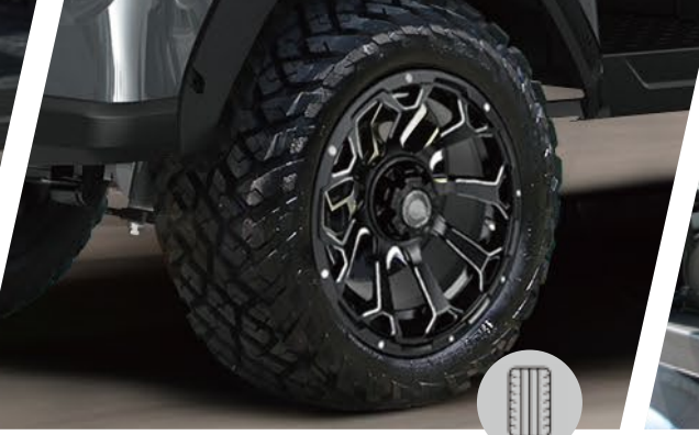
SILENT TIRE WITH OFF-ROADTHREAD

14x7"aluminum wheel/ 215/55r14" radial tire